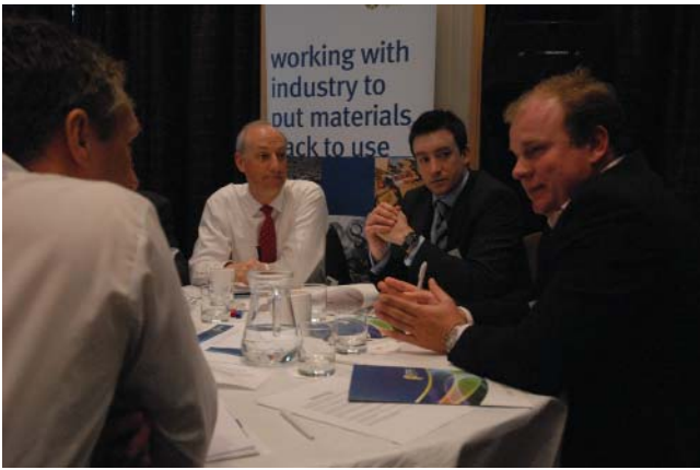
Lively debate during table discussion at PTZW launch event on 3 March 2009.