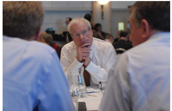
Lord Chris Smith, Chairman, Environment Agency, hosting table discussion at PTZW launch event on 3 March 2009.