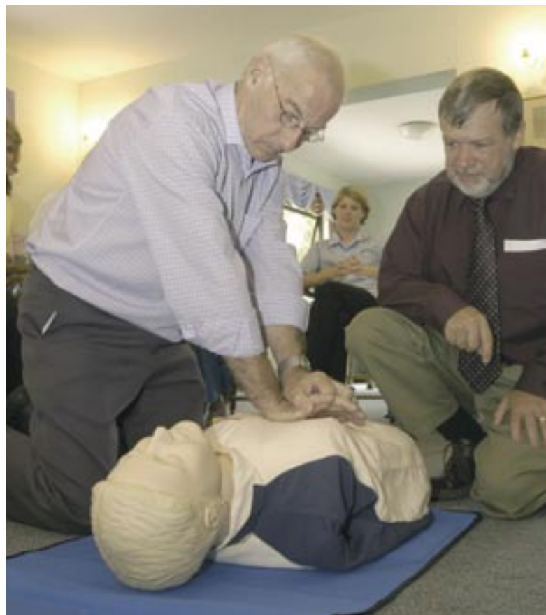
Learning first aid first hand at Solent Skills Quest.

Solent Skills Quest, a social enterprise training company, has tackled isolated rural SMEs across central Hampshire. The inhibitors to growth are identified and matched to a flexible programme of education and training.