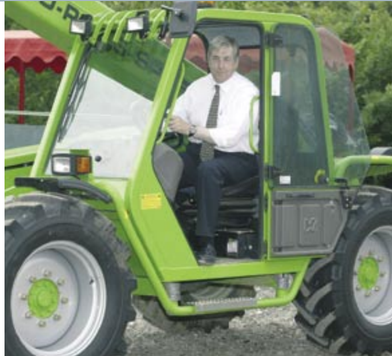
SEEDA appointed six Sector Skills Development Managers in the year to focus on specific sector needs.

Employer Learner Networks have been identified and are starting to improve links between businesses and training providers, Higher Education Institutions (HEI), Further Education (FE), Centres of Vocational Excellence (CoVEs).