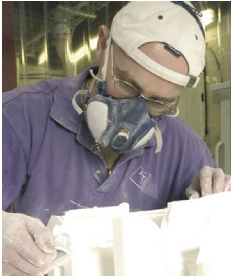
The SEEDA-funded Rapid Product Development Network jointly represents one of the largest educational resources of Rapid Product Development staff and equipment in Europe.