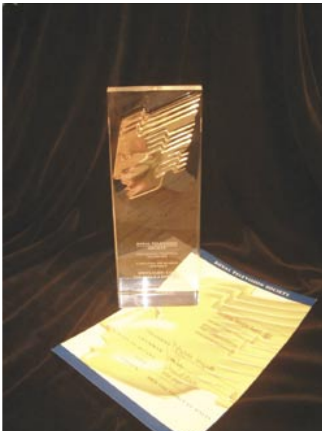
SEEDA co-funded the Meridian Spotlight 2002 programme, which won Campaigns and Seasons Award at RTS Educational Television Awards.