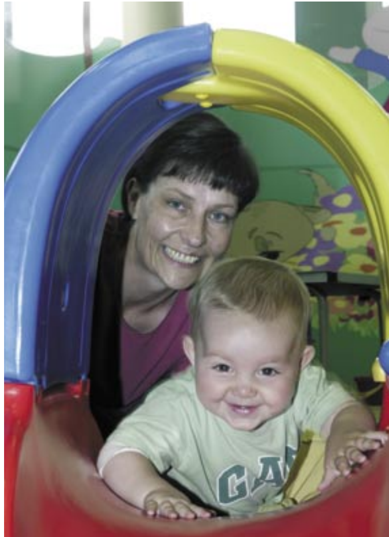
SEEDA appointed six Sector Skills Development Managers based in Local Learning and Skills Councils (LLSCs) with responsibilities for sectors ranging from Aerospace to Care and Early Years.

SEEDA's Learning and Skills Division continued to work with partners throughout 2002-2003 towards the objectives set out in the Regional Economic Strategy (RES). By 2012, the aim is that the South East will be one of the top 15 regions in the world in terms of labour productivity and employment rates.