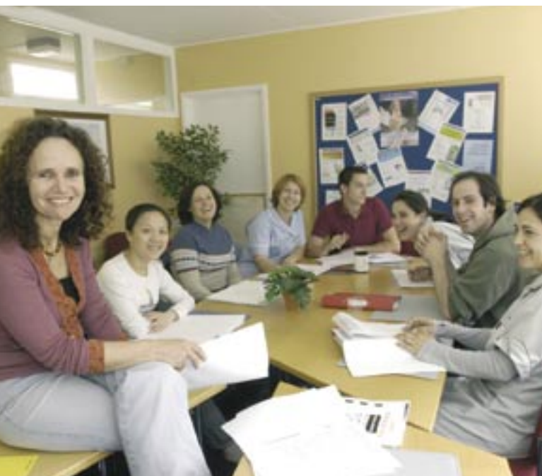
The SEEDA-funded Stepping Stones project at the Oxford Radcliffe Hospital Trust. Learners receiving workplace literacy, numeracy support from a Stepping Stones tutor at one of the Trust Hospital's training rooms.

SEEDA has recently contracted and set up one regional and six sub-regional pilot projects to support 3,000 individuals and 1,000 companies in the South East. The aim of all the projects are to increase the number of business mentors, employer learning networks and use of diagnostic packages to increase productivity in the businesses taking part.