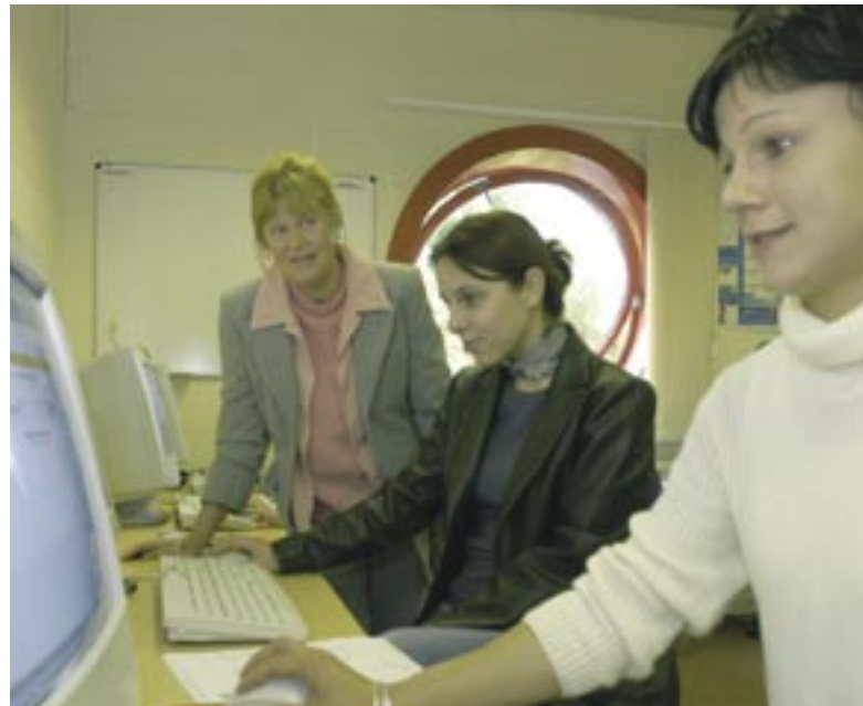
4,000 people have enrolled on ICT taster courses across the region.

Meridian Spotlight 2002 programme (funded by SEEDA, DfES and LLSCs) focused on the use of the Internet for people to understand their own financial circumstances. This encouraged people to learn computing skills.