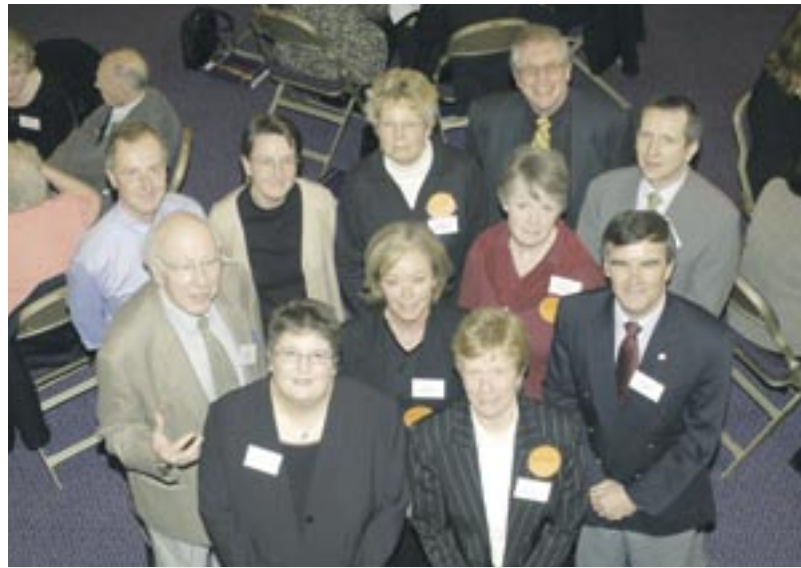
SEEDA funded The Older Person's Conference, Winchester, which focused on the role of older people in the region.

Another innovative scheme was launched in the year called 'Get Wired For Free' which offered free refurbished, Internet-ready computers and training to voluntary and community organisations working with older age groups.