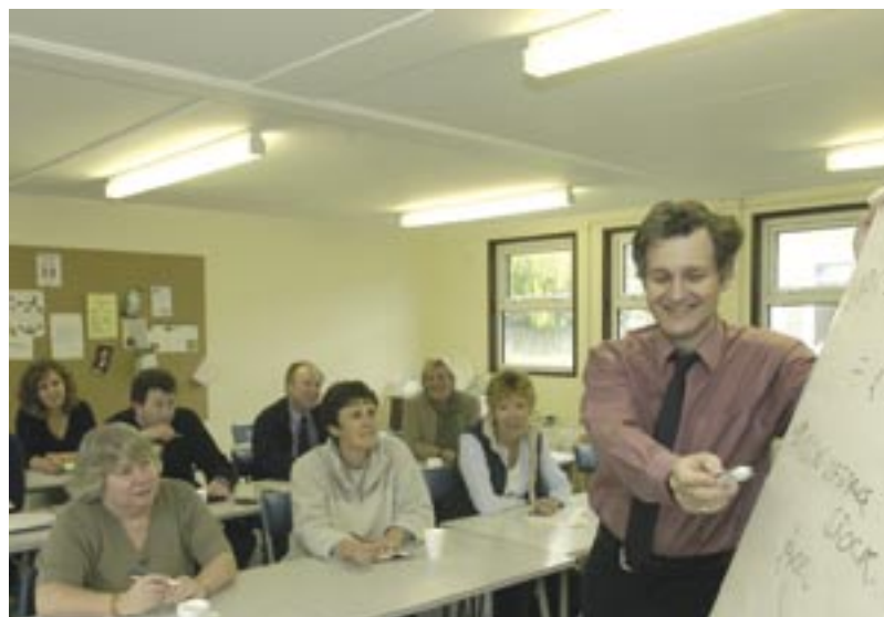
SEEDA funds a programme at Seaford Head Community College, which works with the community to improve skills available to local businesses.

SEEDA awards contracts to projects to deliver basic skills in the workplace in innovative ways, seeking to engage with harder to reach groups of workers. One example is Seaford Head Community College who have been working intensively in an industrial estate where 80% of the workers have significant Basic Skills needs. The trainers are local people who have come from similar backgrounds themselves.