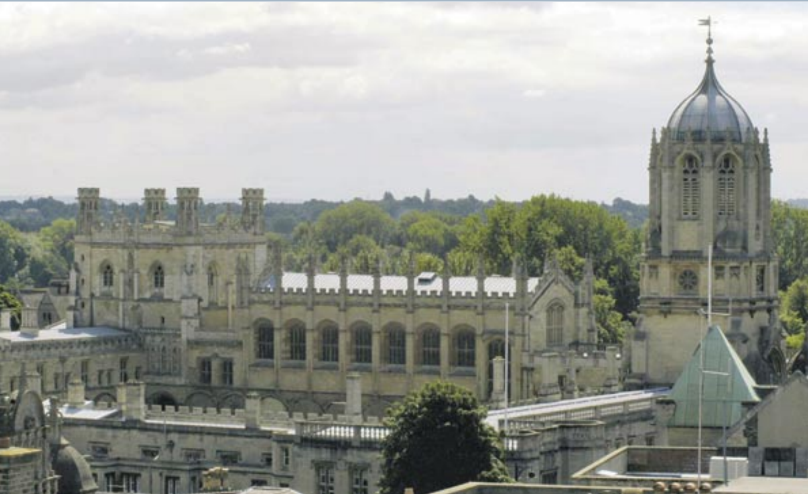
Oxford City - The challenge for the region is to convert its tremendous intellectual capital into greater productivity.

The Global Regions benchmarking exercise (Huggins Report) commissioned by SEEDA, places the region consistently in the top 10 of the 40 global regions for knowledge economy indicators (e.g. ICT, Pharma bio industries) but in the bottom quartile for Gross Domestic Product (GDP) and productivity indicators.