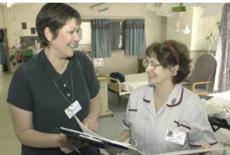
3,044 learning opportunities were provided by projects based in the NHS.