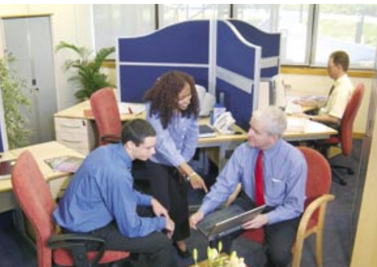
Great Ideas in Science and Technology (GRIST) turns students' ideas into commercial reality.

In order to enable enterprising graduates to develop their ideas, we are providing support and encouragement through three universities in the Hatcheries project (also known as GRIST – Great Ideas in Science and Technology), which will provide financial support and mentoring to allow students to develop their ideas. This pilot scheme is being carried out in three universities – Brighton, Kent and Surrey – to develop best sustainable practice, with two of the Hatcheries being set up in significantly deprived areas (Hastings and Thanet) to encourage regeneration.