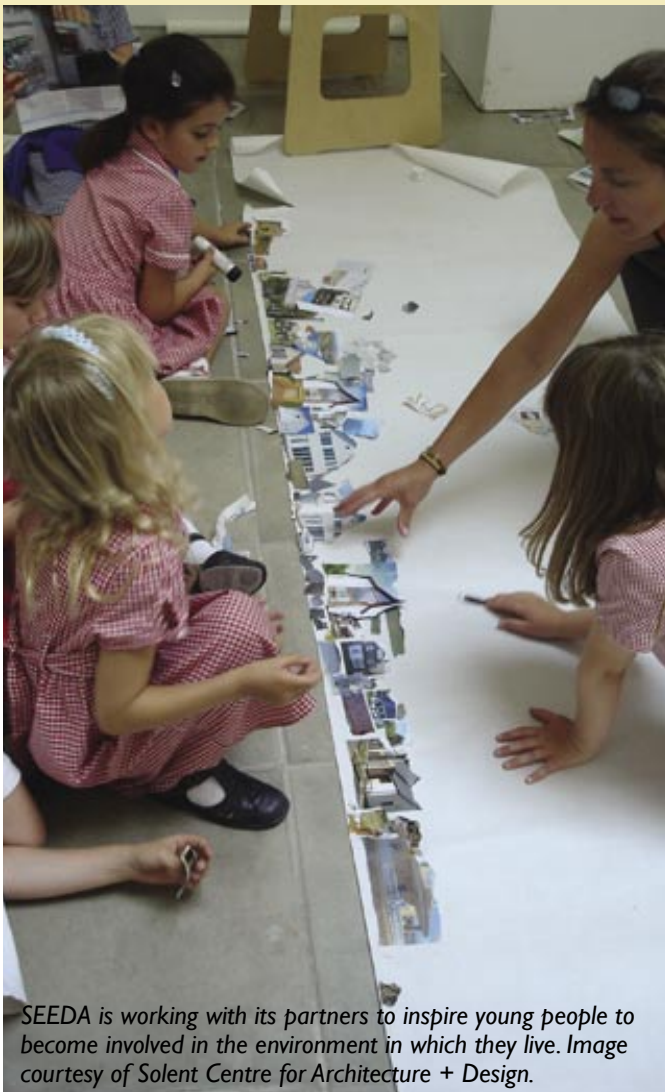
SEEDA is working with its partners to inspire young people to become involved in the environment in which they live.

We must also make the most of the skills, knowledge and experience of the region's universities and colleges. The region has a wealth of talent in the higher and further education sectors but it is not always well known amongst practitioners. We need to facilitate closer collaboration and exchange amongst the education sector and businesses.