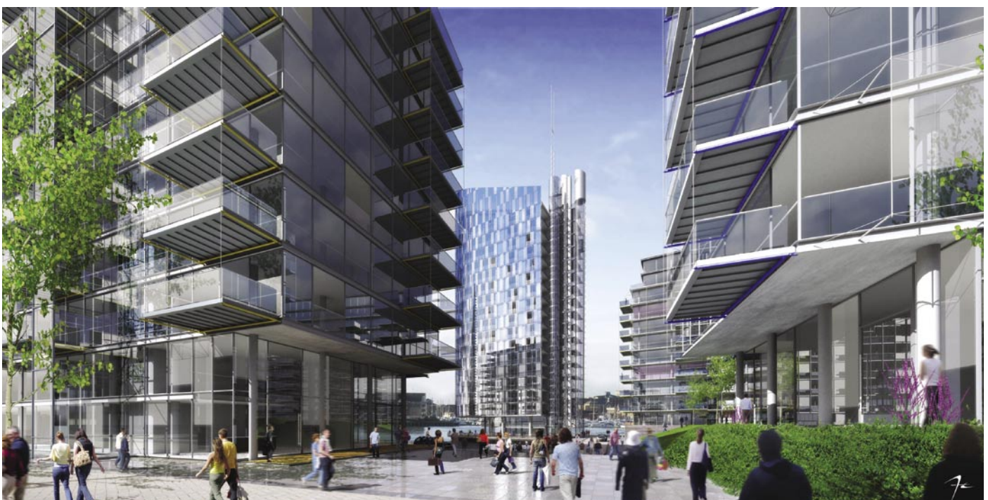
The SEEDA owned Woolston Riverside development in Southampton will comprise residential, retail, leisure, employment and marine related industry.

The South East Design Champions Club is the first of its kind in the English regions. Design Champions ensure a high profile for quality design within their