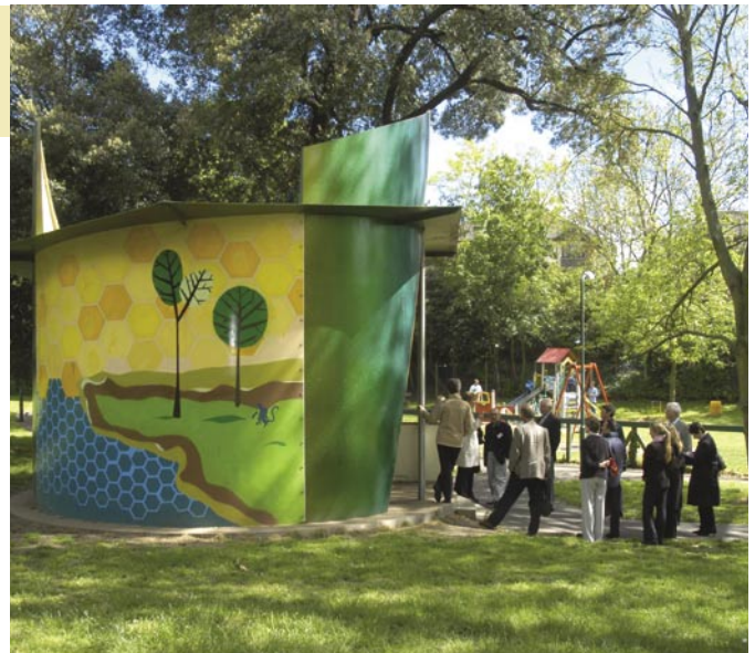
The South East Design Champions Club was the first of its kind. Design Champions ensure a high profile for quality design within their organisations.

The region's Architecture Centres support the delivery of sustainable, high quality and well planned developments across the South East. They provide training for elected members, design advice to local authorities, and an advisory service to communities on planning and urban design issues on local development proposals.