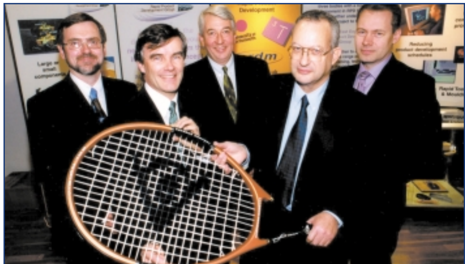
Lord Sainsbury, Minister for Science and Innovation, at the launch of the Rapid Product Development Group. He is pictured with a publicity model of Dunlop's latest tennis racquet, Inferno. The application of Rapid Prototyping techniques to this product reduced halved the normal development time.