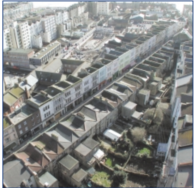
Arial views of Hastings town

Task Force may now enter into wide consultations within the local community to determine the details of how the various elements should be taken forward.