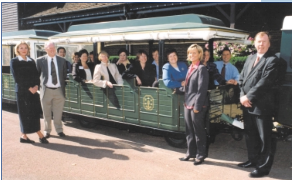
Bid winners get on board SEEDA's Basic Skills drive in the South East

Contact: Barbara Bicknell, SEEDA Guildford, 01483 484252