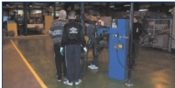
Classic before and after pictures from F. C. Brown factory floor at Bisley

opment opportuni- es provided mutu- ach other's facili- training applica- mentation of the the end of the e companies had a ithin their own who had experi- mprovement tech- ey achieved a dra- ment within their itions. want attended a rkshops in differ- nts that accelerat- ng and experi- nts were enthusi- e effectiveness of mprovement' s in allowing them