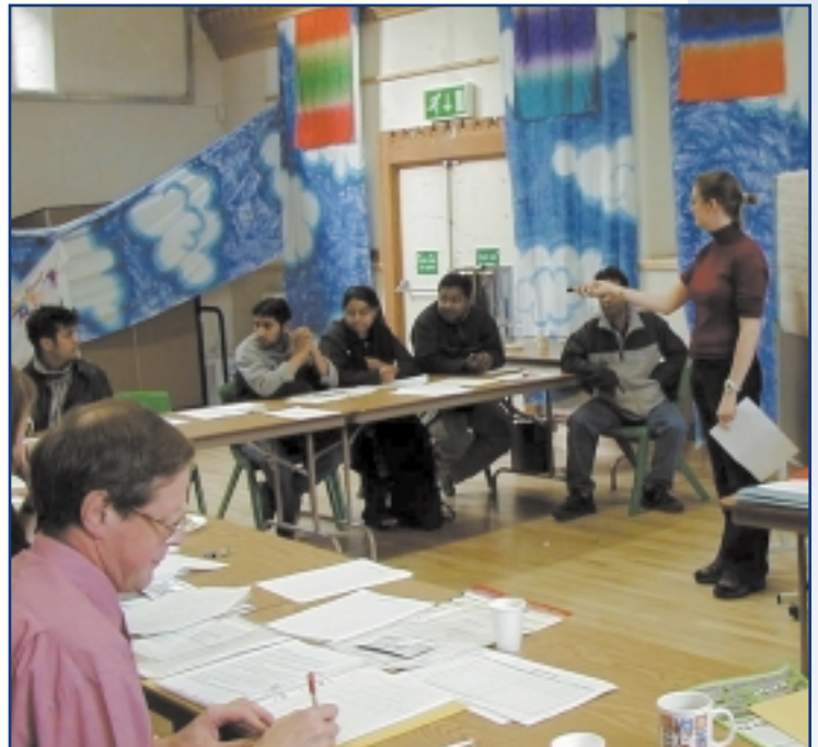
Through the ORSP in Oxford, asylum seekers have taken part in local community events, like Mapping Matters and the Cowley Road Carnival.

This has indeed proved to be the case - ORSP is now receiving a European Social Fund grant, a grant from the Princess Diana Memorial Fund and commitments from a range of statutory agencies.