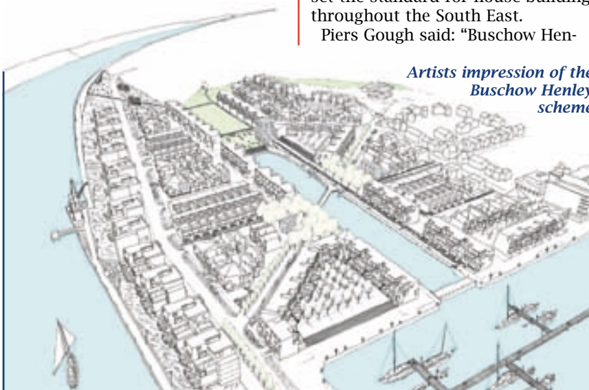
Artists impression of the Buschow Henley scheme