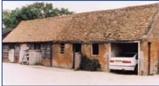
Before and after... a successful outbuilding conversion at Hill Farm, Newington, Oxfordshire carried out from last year's scheme. The next round of applications closes in August