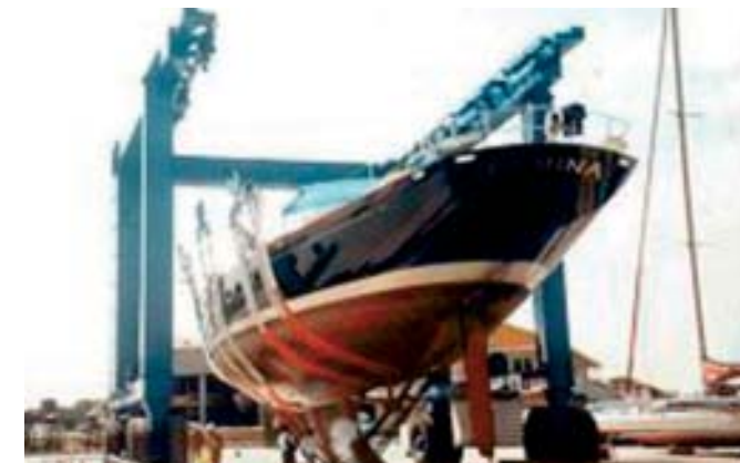
Boat travel lift.