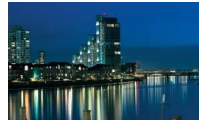
Montevetro, London. Architect: Richard Rogers Partnership.