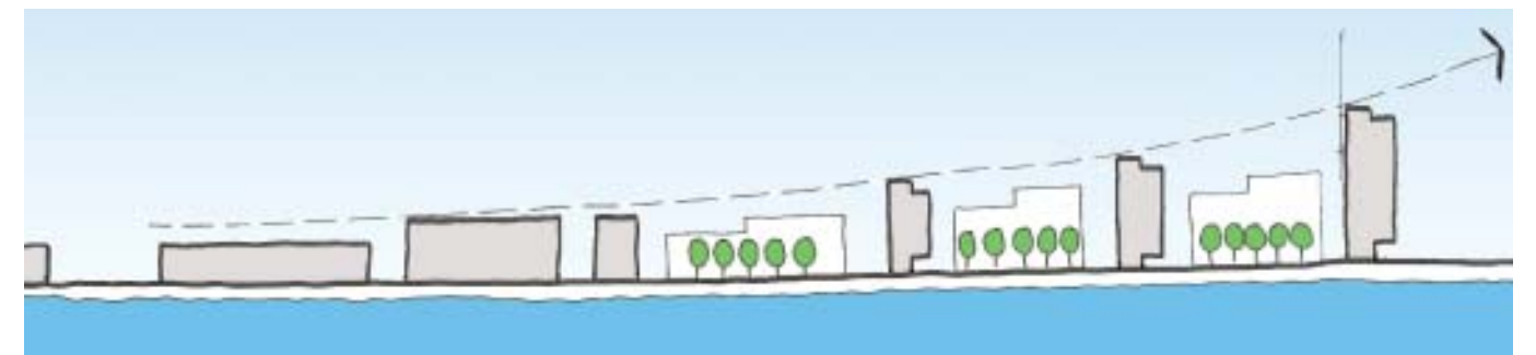
View from the River Itchen.