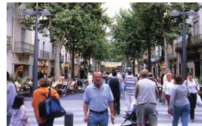
Vilanova i la Geltru, Catalonia, Spain.